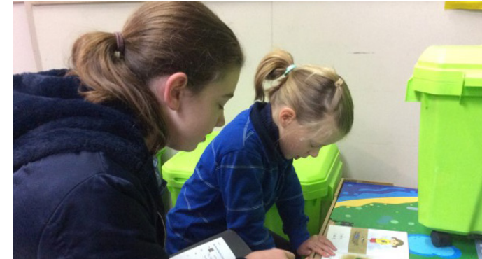
Young people and school communities discovering purpose, value and hope